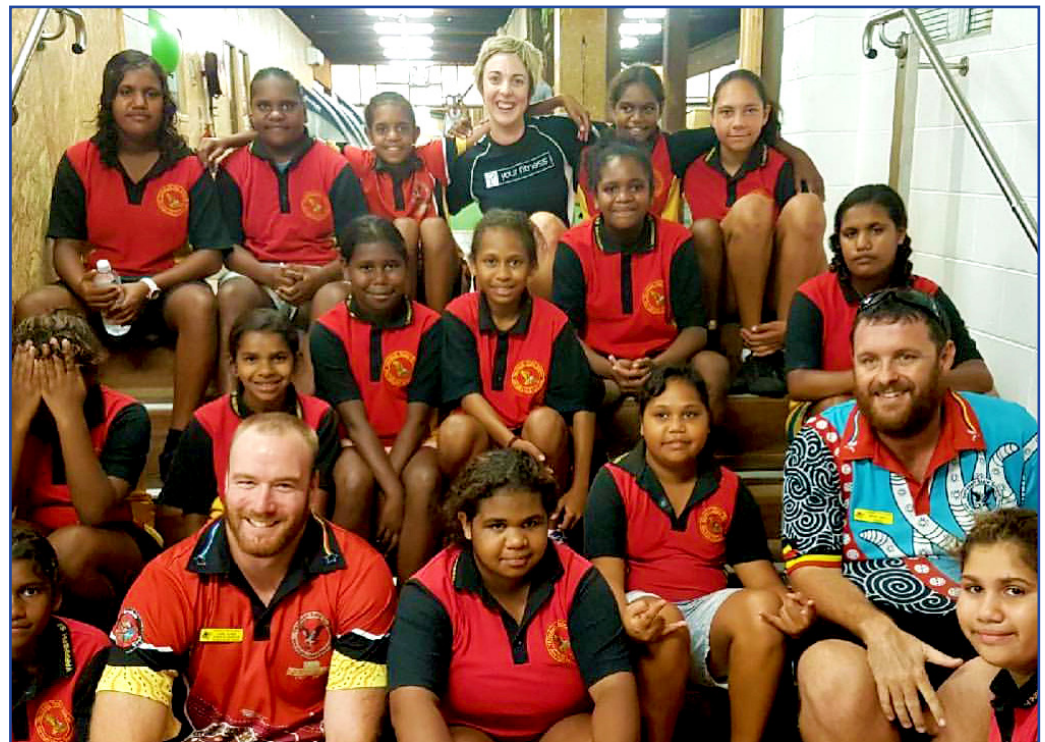
ABOVE: Your Fitness, a 24-hour gym in Cairns, said they had the pleasure of working with the Yarrabah female rugby league team late last month.

"The girls killed it on the gym floor," they said.